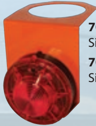
7036 - R (Red)