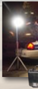
Cat. No. 4346

Dual Receptacles: Marine 12v Female Cig. Receptacle (12A) Marine Heavy Duty Female Locking Receptacle (20A)