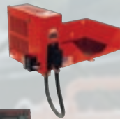
Cat. No. 4256 Responder DC Vehicle Mount Charger

Fully automatic DC input DC output Hardwired directly to vehicle battery