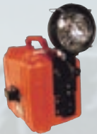
Cat. No. 7860

This very popular Robopak is able to power hundreds of DC powered tools, lights and equipment with voltage requirements of 6v-28v (Milwaukee, DeWalt, Hilti, Bosch, Makita, Greenlee, Huskie, etc.) The XL 9210 can be taken where you need it. With the Variable Voltage "Plug-and-Go" Power Receptacle, set up takes less than two seconds. Simply plug your adapter into the Robopak to get the proper voltage. Encased in a heavy duty all weather high impact plastic casing with durable "O" rings and a shoulder strap, this Robopak also has a quick-connect side mount "super brite" flood light system (light is sold separately). Charge friendly, the XL 9210 can be recharged at any point of discharge and can be left on charge when not in use. Additional features include a refurbish program that will save you thousands of dollars.