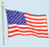
Cat. No. 3482

Tired of running out of power? Need a reliable, cost effective, long lasting battery system to power your tools, lights and equipment that require from 6v to 28v to operate?