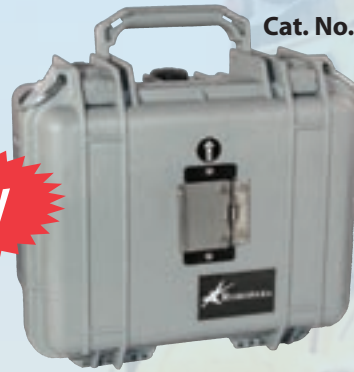
Cat. No. 3045

Proprietary system features high power output to weight ratio, high efficiency, excellent abuse tolerance, environmentally friendly and very long life. Cycle life at 10C and 100% discharge is over 1,000 cycles! This Robopak will last you years and save you hundreds if not thousands of dollars.