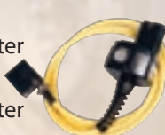
Cat. No. 5273