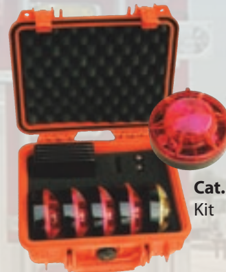
Cat. No. 7029 Kit